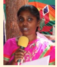
Veronica Data Entry