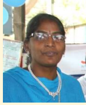
Swaroop Unit In- Trainee