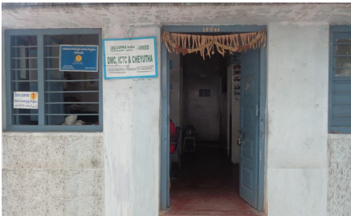
Cheyutha Office, Red Cross premises, Gaddiannaram, Hyderabad